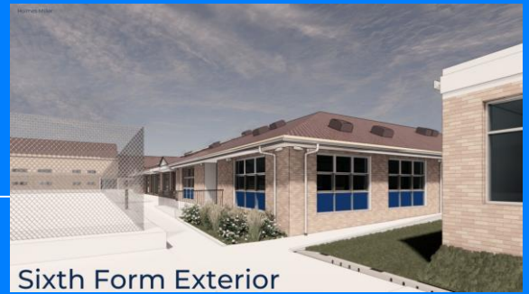
Sixth Form Exterior

The Cottesloe School is delighted to announce the recent approval of planning permission to improve its facilities. The school continues to grow in popularity and has agreed to meet the need for more school places in North Bucks. This expansion will see Year 7 to 11 expanding to 210 students, an increase of 20 students per year group, over the coming years. This significant development marks a milestone in the ongoing commitment to provide quality education infrastructure for the growing local community.