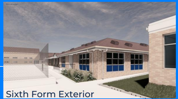
Sixth Form Exterior

The Cottesloe School is delighted to announce the recent approval of planning permission to improve its facilities. The school continues to grow in popularity and has agreed to meet the need for more school places in North Bucks. This expansion will see Year 7 to 11 expanding to 210 students, an increase of 20 students per year group, over the coming years. This significant development marks a milestone in the ongoing commitment to provide quality education infrastructure for the growing local community.