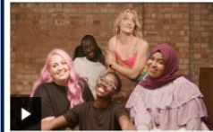
Celebrating my identity

https://www.bbc.co.uk/bitesize/articles/z7q3hbk