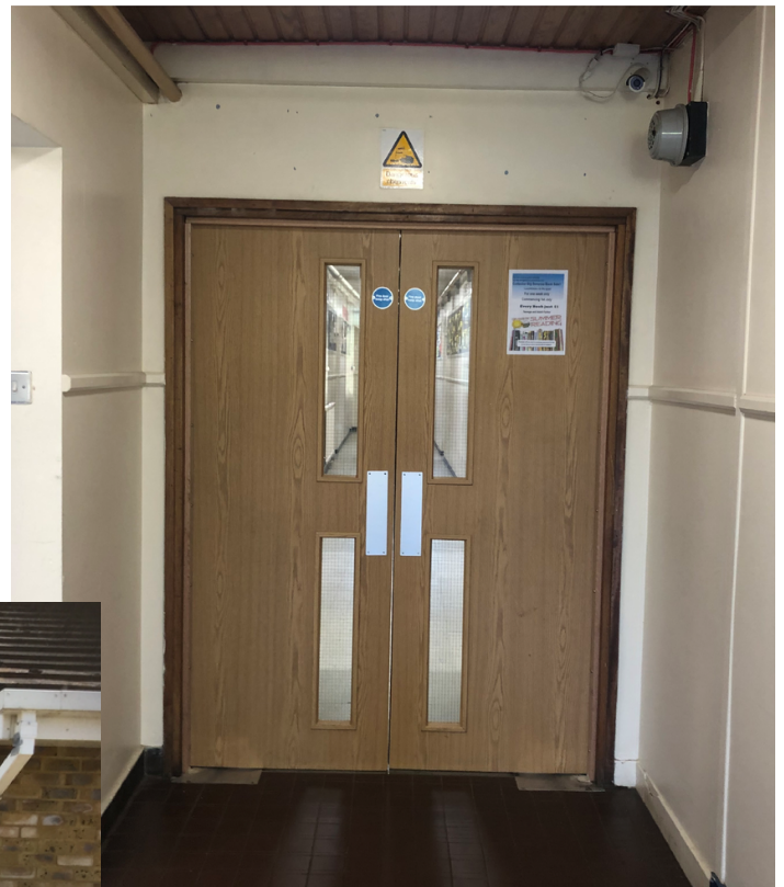
'New' Science block entrance