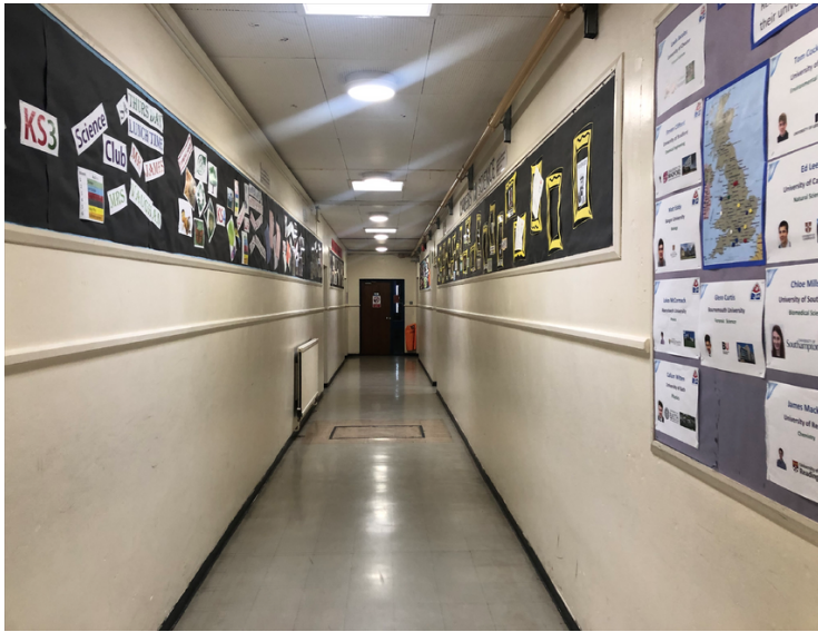
'Old' Science entrance (inside)

This has two entrances - here is the 'Old' Science and 'New' Science.